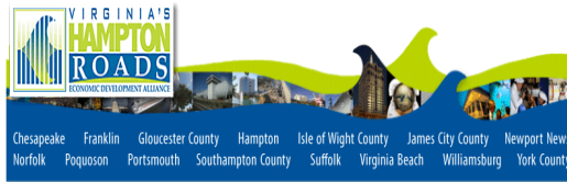
Hampton Roads Economic Development Alliance

*Early Bird registration is available through April 3, 2009. General registration will end on May 31, 2009. On-site registration will not be available. For information, please call (757) 238-7790 or visit www.diversityrestoration.com .