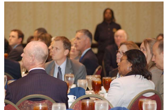
HREDA Luncheon Table